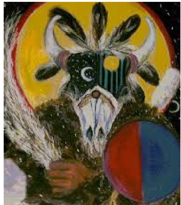
Mattaponi Tribe artwork

The Native Americans in our area have been through very trying times and partnering with this organization has been extremely fulfilling as an outreach opportunity for our entire community and an outlet for living by the Quaker testimonies. VBFS hopes to continue working with the wonderful people of Spirit Rising for many years to come.