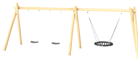
Kompan double swing combination