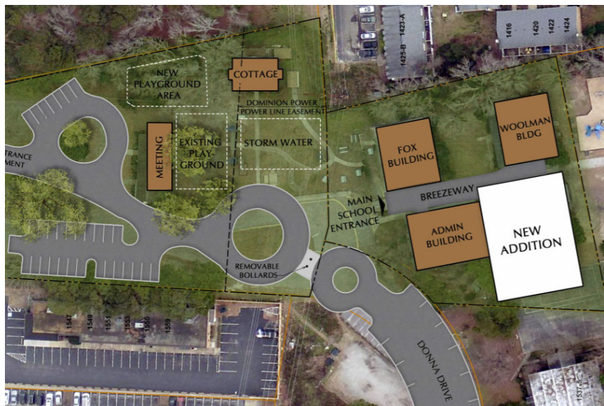
Aerial view of Friends School future campus