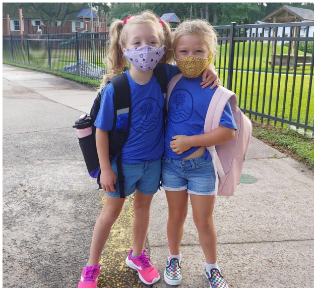
VBFS Early School students, late summer 2020