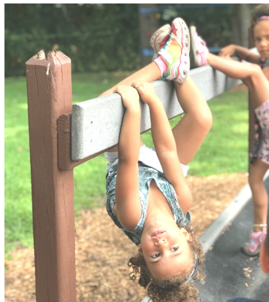
Hanging out at Virginia Beach Friends School

The takeaway for the entire Friends School community is that VBFS is on the move and the future is BRIGHT! Despite the challenges we have faced, the best is yet to come for Virginia Beach Friends School with exciting times on the horizon for our amazing school. We have aggressive timelines to finish our campus master plan, and we are confident that we will be able to continue to provide the best education and best experience to all of our students. Thank you for trusting in our planning and being part of the future at Friends School!