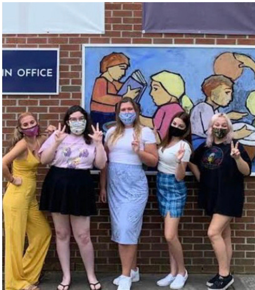
VBFS graduating class of 2020