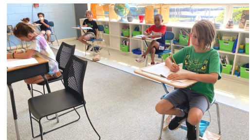
In-person learning fall 2020