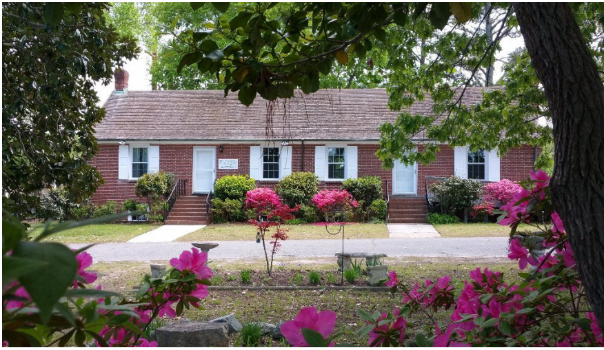
Virginia Beach Friends Meeting House

simplicity peace integrity community equality stewardship