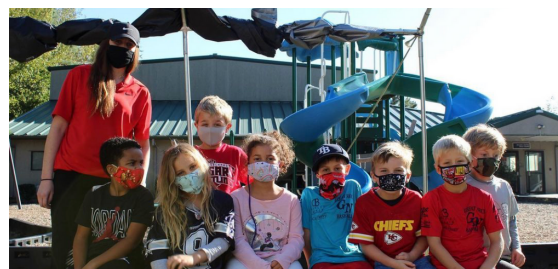
Recess at Virginia Beach Friends School