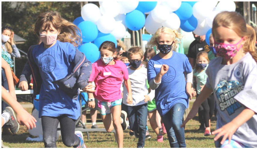
Virginia Beach Friends School Fall Fun Run